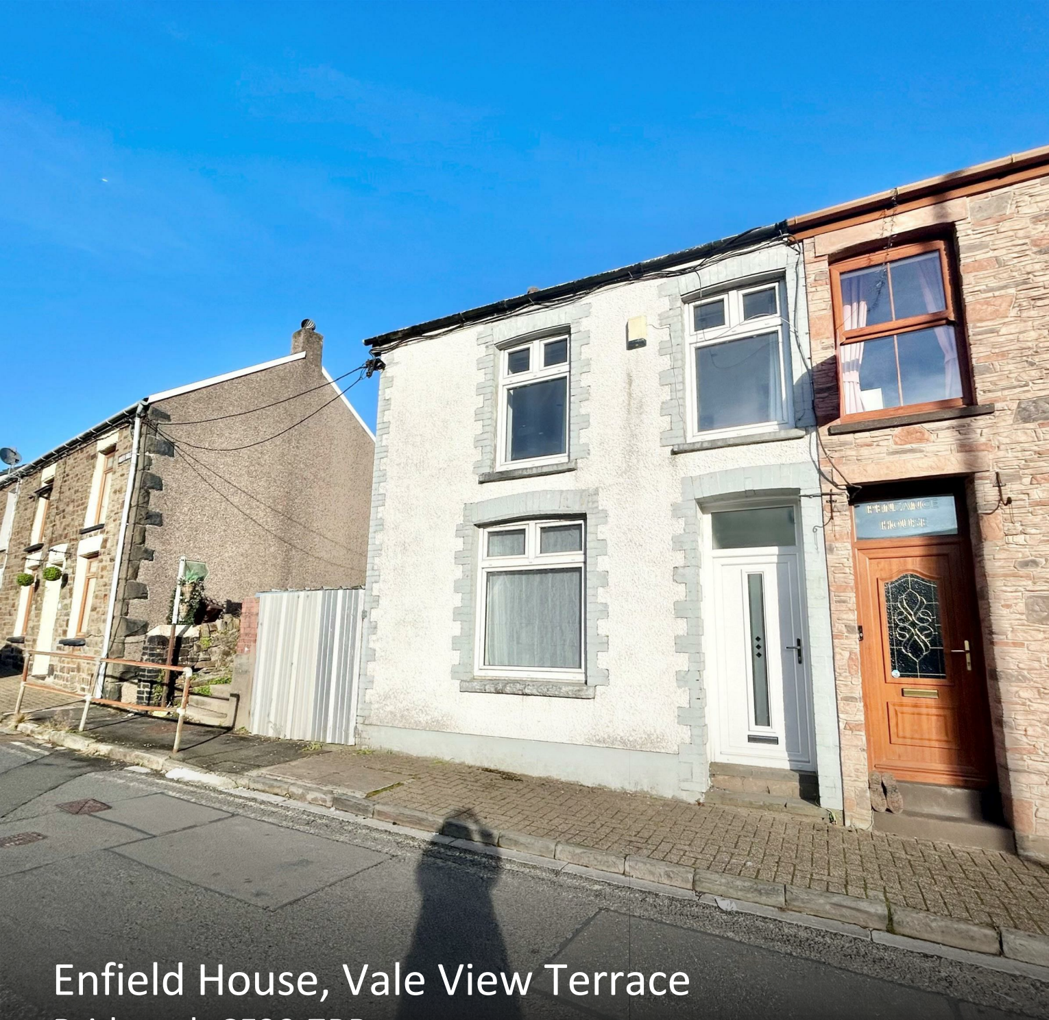
Enfield House, Vale View Terrace Bridgend, CF32 7PB